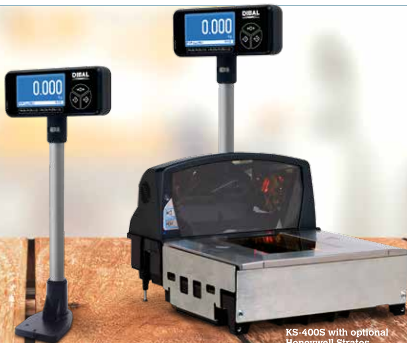
KS-400S with optional Honeywell Stratos MK2400 scanner (scanner not included)