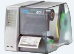
Label printers EOS4 Desktop device for label rolls up to diameter 203 mm