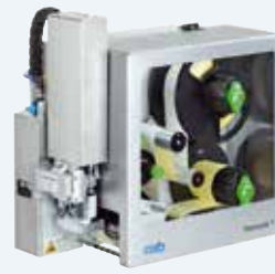
Print and apply systems Hermes+ for automation