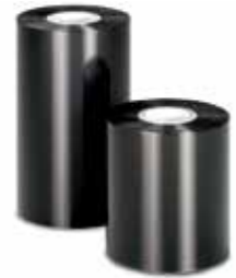
Color: black Ink: outside Core Ø: 1"