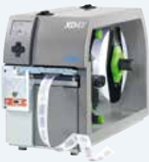
Label printers XD4T for double-sided printing