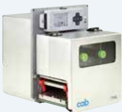
Print modules PX to be integrated in labeling machines