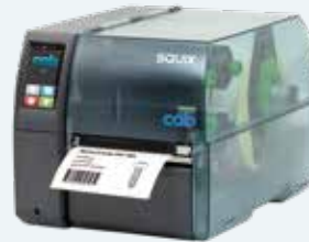
Label printers SQUIX 6 Industrial device for print widths up to 168 mm