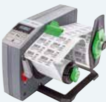
Label dispensers HS, VS for horizontal or vertical dispense