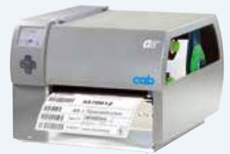
Label printers A8+ Industrial device for print widths up to 216 mm