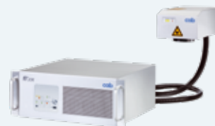
Marking lasers FL+ with output powers 10 to 50 Watt