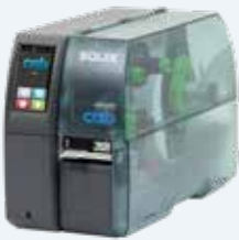
Label printers SQUIX 2 Industrial device for print widths up to 57 mm