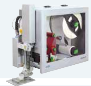
Print and apply systems Hermes C for two-color printing and applying