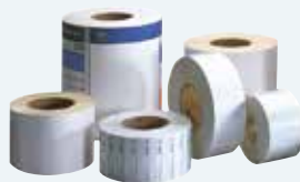
Labels made from more than 400 materials