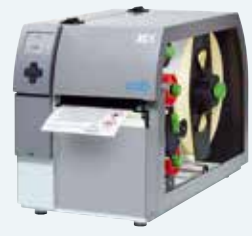
Label printers XC for two-color printing