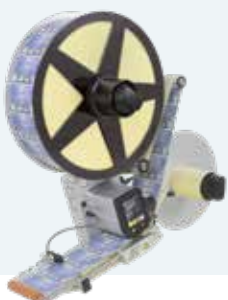
Labeling heads IXOR to be integrated in labeling machines