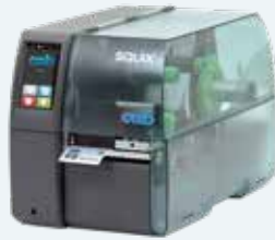
Label printers SQUIX 4 Industrial device for print widths up to 108 mm