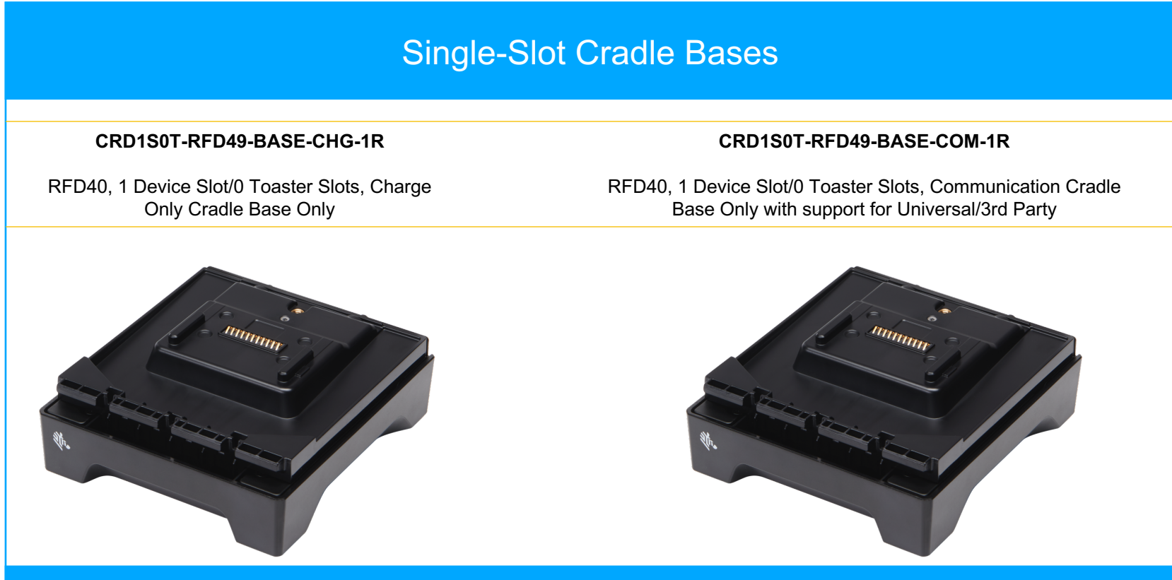
Requires Power Supply (PWR-BGA12V50W0WW), DC Line Cord (CBL-DC-388A1-01), and Country Specific Line Cord.

Requires RFD40 Replacement Cradle Cup(s)