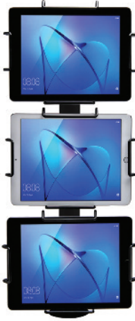
TRI MOUNT Tablet tilt: + 90°, -60° Tilt Angle: +45°, -45°a WxDxH: 116 mm wide 178.5 mm deep 585 mm high Weight: 2.69 Kg VESA Weight Capacity: 8.5 Kg Monitor Size: 10in to 32in