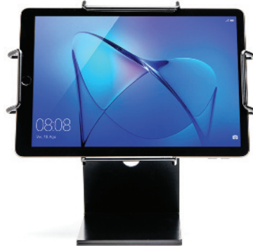
EZDESK Tilt: +115°, -15° WxDxH: 150 mm wide 221 mm deep 183 mm high Weight: 2.28 Kg EZDesk can be mounted for secure installation.

* Tablet and printer not included. mEnclosure tablet holder must be ordered separately.