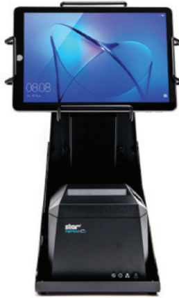
EZ100 Tilt: +45°, -45° WxDxH: 176 mm wide 268 mm deep 340 mm high Weight: 4 Kg