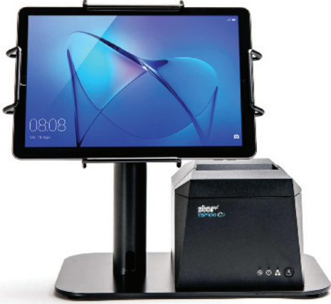
EZPOS Tilt: +45°, -45° WxDxH: 300 mm wide 200 mm deep 206 mm high (To top of post) Weight: 2.28 Kg