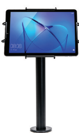
MOUNT 18 Tilt: +90°, -60° WxDxH: 150 mm wide 116 mm deep 437 mm high Weight: 3.5 Kg VESA Weight Capacity: 8.5 Kg Monitor Size: 10in to 32in