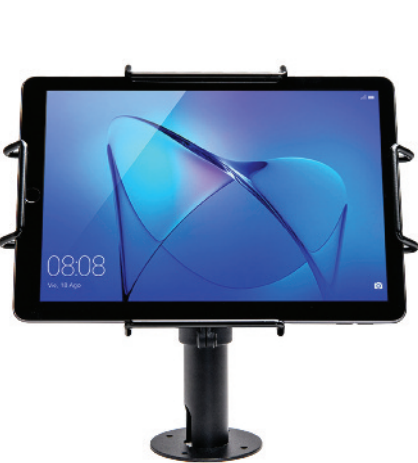
MOUNT 7 Tilt Angle: +150°, -15° Rotation ± 180° WxDxH: 104.9 mm wide 116 mm deep 247 mm high VESA Weight Capacity: 4 Kg Monitor Size: from 12 inch

Star Micronics has created multiple stylish tablet mounts to free up and declutter workspace while keeping valuables secured in one area. They attach to most walls and countertops with everything needed to get set up included. Incredibly modern and space-saving, these tablet mounts are perfect for online ordering for the restaurant or QSR industry, retail, hospitality industry, or any establishment where tablets are regularly used and can be stationary. Tablets are well-protected and easily accessible while out of the way in busy environments. * Tablet and printer not included. mEnclosure tablet holder must be ordered separately.