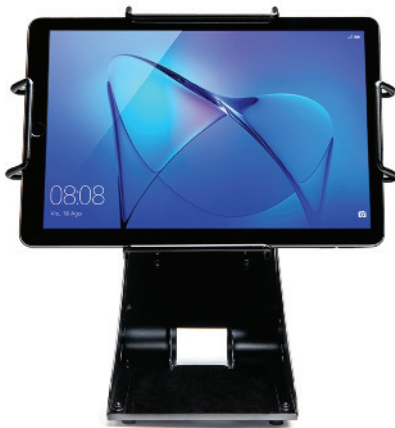
EZ3 Tilt: +50°, -5° WxDxH: 162 mm wide 229 mm deep 280 mm high Weight: 3.8 Kg

* Tablet and printer not included. mEnclosure tablet holder must be ordered separately.