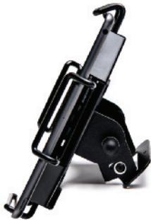
WALL MOUNT Tilt: +35°, -30° WxDxH: 66.2 mm deep 116 mm wide 116 mm high Weight: 0.8 Kg