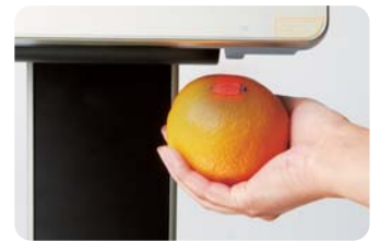
Built - In Barcode Scanner

Workspace is reduced as the SM-5000BS comes with an optional barcode scanner that is ergonomically built into the scale.