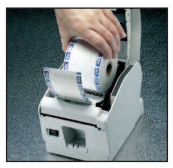
"Drop In & Print" Paper Loading