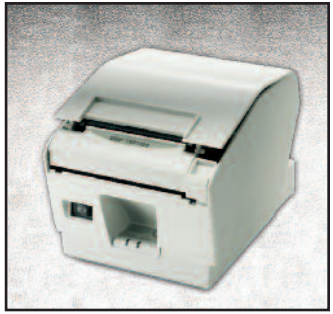
Clamshell, Spill and Dust Proof Design