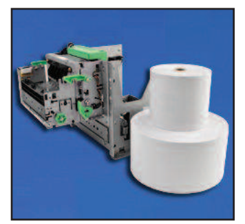
80mm-112mm Paper Width

Visit www.starmicronics.com to learn more.