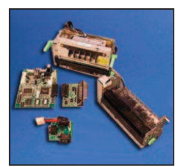
Parts Breakdown Available