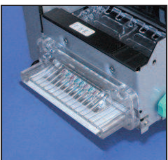
Optional Flashing LED Bezel