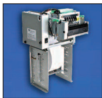
Optional 10″ Diameter Paper Roll Holder