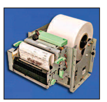
Looping Presenter with Document Presenter