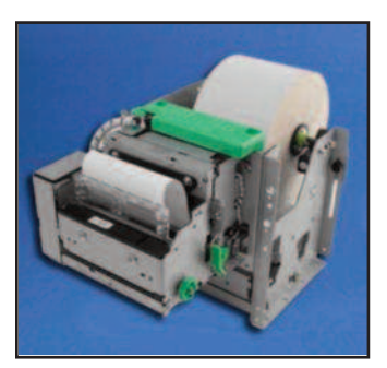
Looping Presenter with Document Presenter